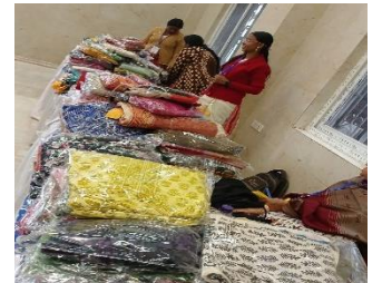
Old Garments Distribution