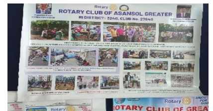
PARTICIPATED IN THE POSTER COMPETITION.