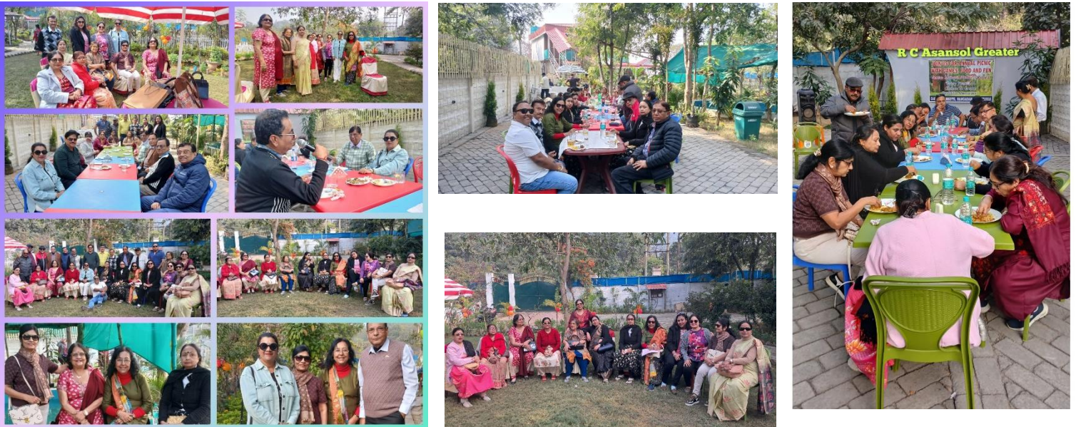
ANNUAL ROTARY 'S FAMILY PICNIC ORGANISED AT MANAVA WELLNESS RETREAT, GARH PONCHOKUT, PURULIA ON 18 TH JAN 2026